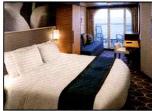
Balcony Staterooms Double Occ. $1,197. Single Occ. $2,294.

Questions? Email: Snow@sobercelebrations.com