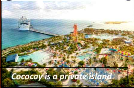
Cococay is a private island

WONDER OF THE SEAS™ 2022 Travel Weekly Readers' Choice Awards