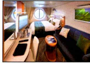
Obstructed Oceanview Staterooms Double Occ. $1,116. Single Occ. $2,132.