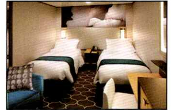
Interior Staterooms: Double Occ. $900. pp. Single Occ. $1,700.

Suites, Triple & Quad cabins available upon request. All cabins in above photos have one or two beds.